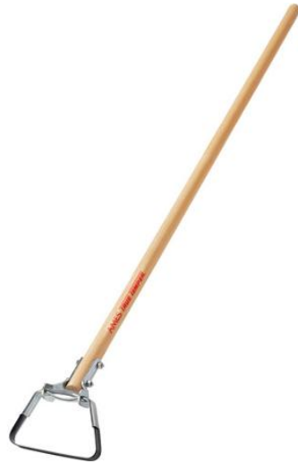
Stirrup or Cultivator Hoe