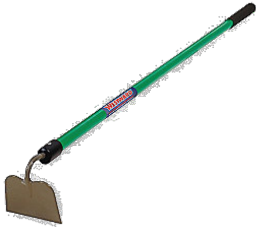
General purpose Hoe