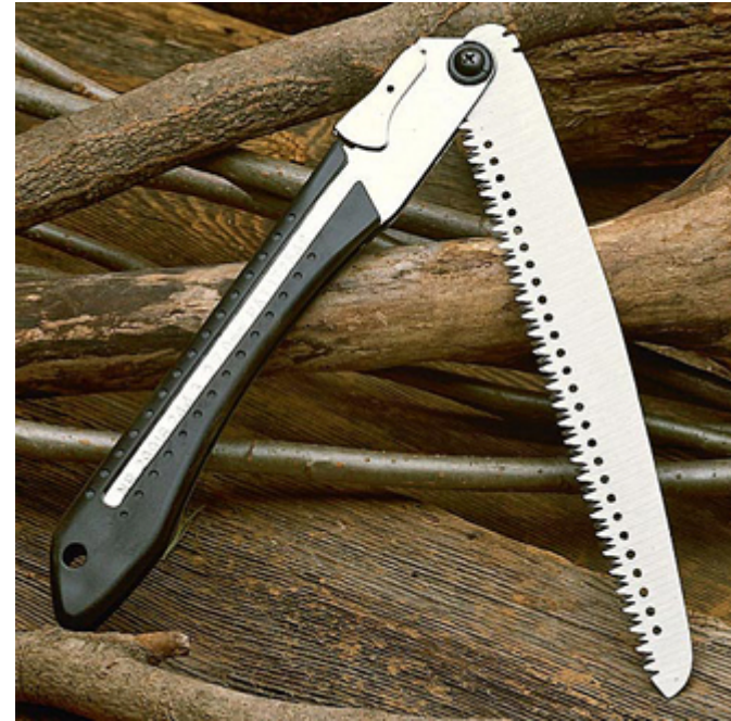
Folding Hand Saw