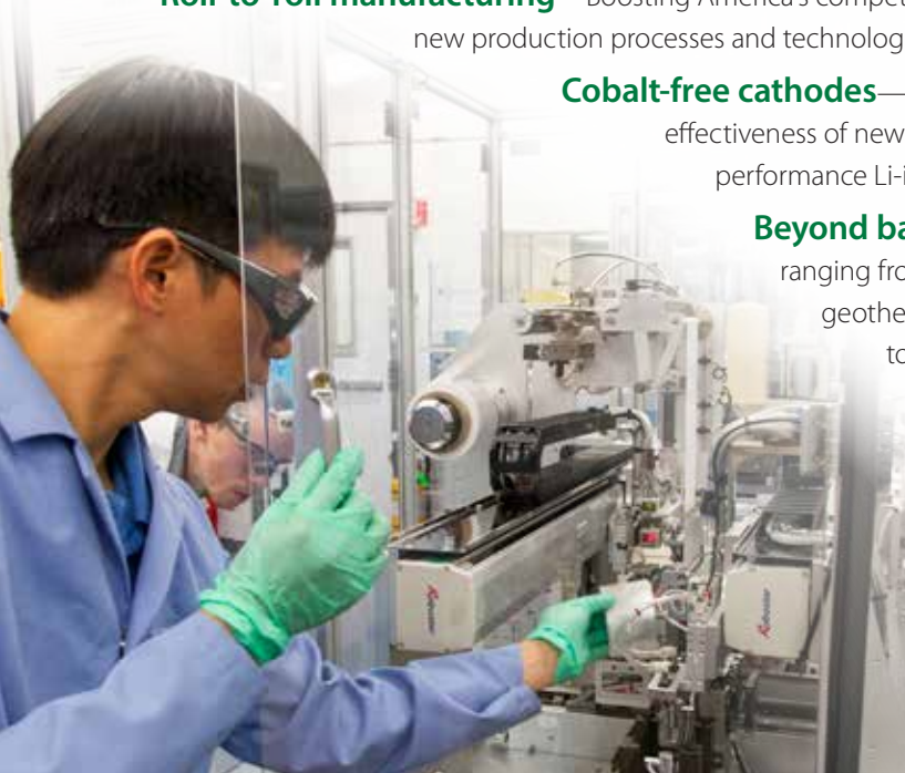
DOE Battery Manufacturing Facility at ORNL

EVALUATING materials from nanoscale to pilot scale