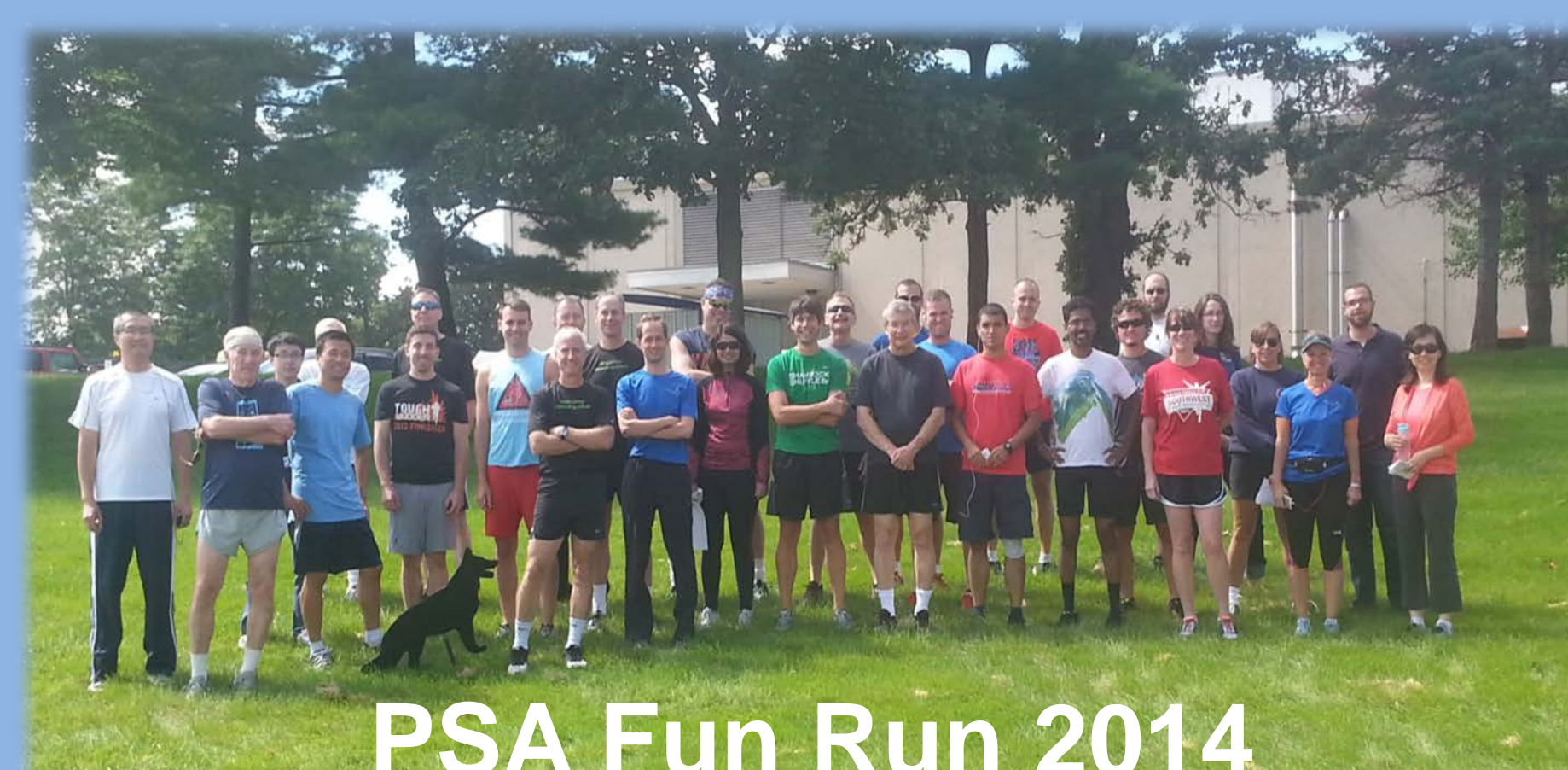
PSA Fun Run 2014