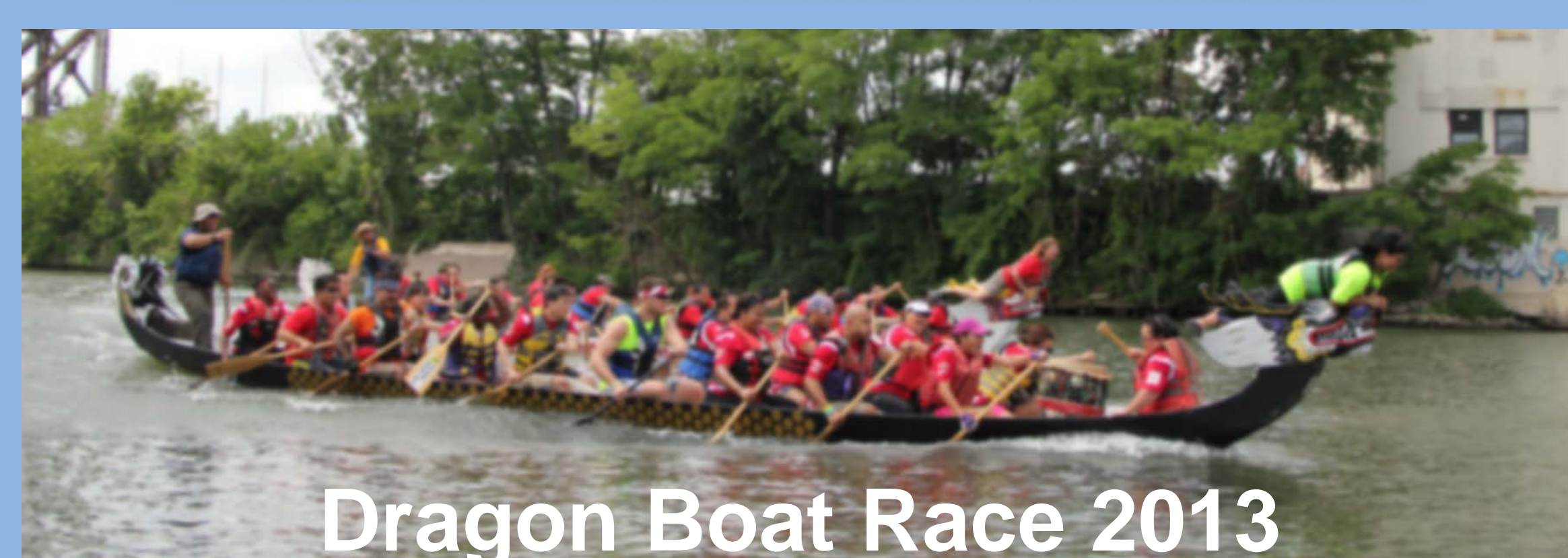
Dragon Boat Race 2013